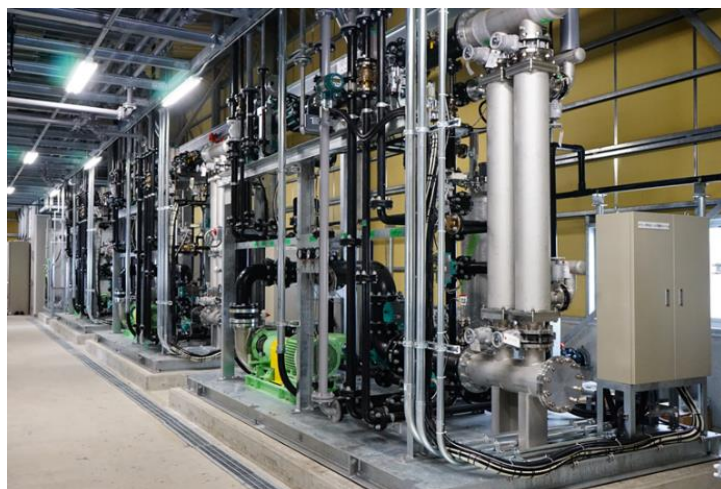
Ceramic membrane filtration unit